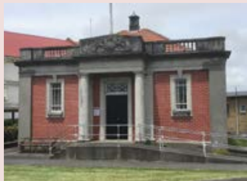
"Nye Cottage", by Val Burr, 2024.