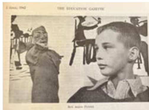
Boy meets puppet' clipping from The Education Gazette 1 April, 1942, supplied by presenter.

Te Marae o Hine - The Square (Wet weather venue is Te Manawa Museum, 326 Main Street)