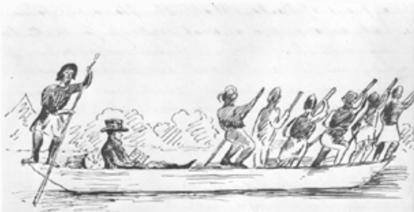
"This is a canoe with one of us." Selwyn, George Augustus (Bishop), 1809-1878 : Letter book of Bishop Selwyn. Ref: qMS-1774-145. Alexander Turnbull Library, Wellington, New Zealand. /records/22870467

See page 38 for event and registration details