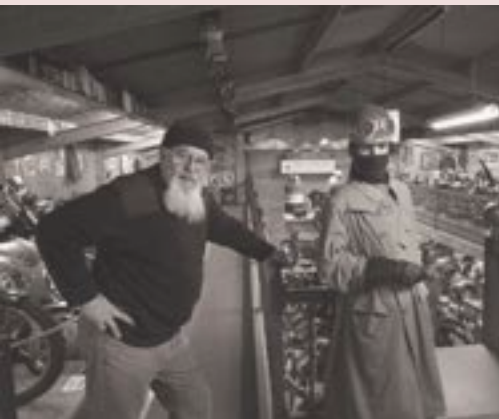
"Thomson Motorcycle Museum" by Leith Haarhoff, 2019, Palmerston North City Library, via Manawatū Heritage.