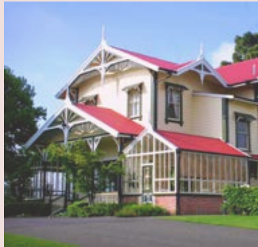
"Caccia Birch", by Palmerston North City Council.