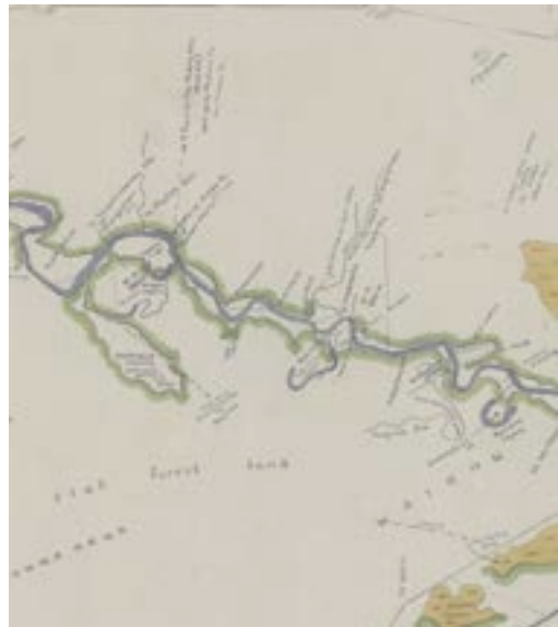
"Te Ahuturanga, Upper Manawatu Block" by A. E. Williams, 1961 [reproduction], Palmerston North City Council via Manawatu Heritage.