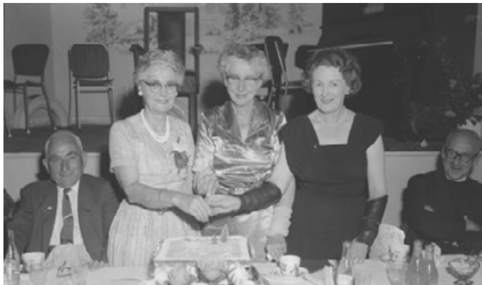
"Christmas Cake for Old Folk", by Manawatū Evening Standard, Fairfax Media, 1962, via Manawatū Heritage.