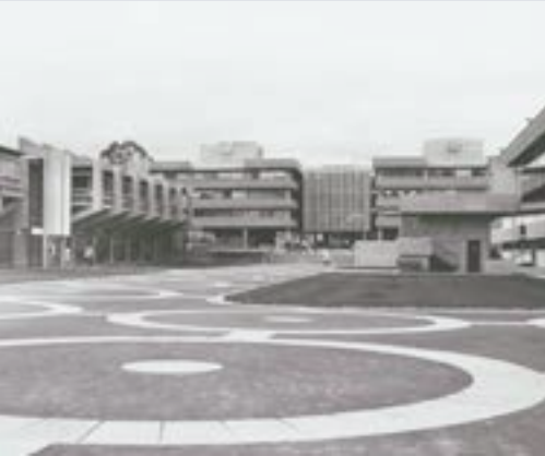
Above: "Concourse, the heart of the Massey University campus, seen here in 1970."

Limited numbers. To register, email heritage@pncc.govt.nz