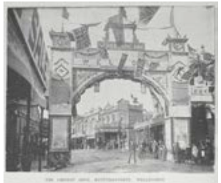
"Wellington's Royal Reception Celebrations, June, 1901"