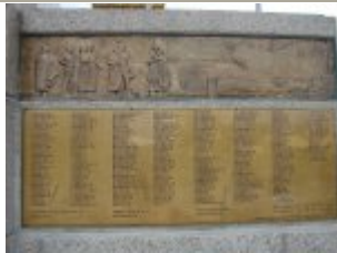
'Updated' Names Plaque No. 2