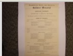
Order of Service for the Unveiling of the Memorial 7th Feb 1926 IM City Archives [PNCC11/8/6]