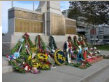
2007 ANZAC Wreaths on the steps of the War Memorial in The Square