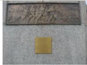
Centre Back Frieze