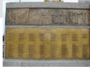
'Updated' Names Plaque No. 1