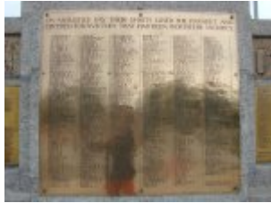
WW1 Names Plaque