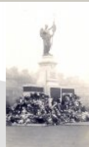
The Palmerston North Memorial was closely modelled on this memorial from Folkstone, England IM City Archives [PNCC11/8/4]