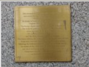
Rededication Plaque - 2005, includes details of the bronze frieze around the War Memorial