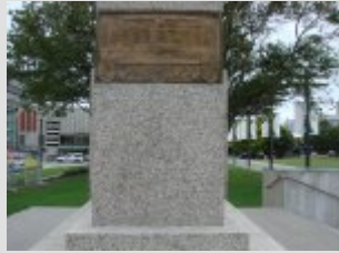
Left End Frieze