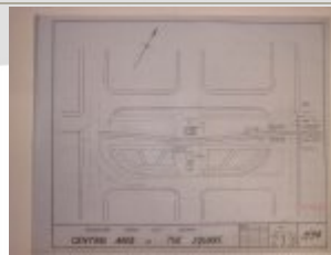
Plan of Railway Diversion for War Memorial in Square IM City Archives [PNCC4/8/2]

For more information on any of the photographs and documents presented here or to obtain copies please contact the Ian Matheson City Archives