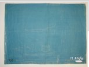
Plan of footpath leading to Memorial in The Square