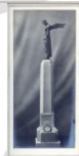
An Initial Design Proposal for the Memorial - Side View IM City Archives [PNCC11/8/3]