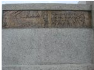
Back Left Frieze