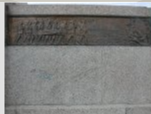
Back Right Frieze