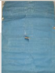
Portion of Proposed Design No. 2 The finished Memorial appears to be very similar to this design IM City Archives [PNCC11/8/3]