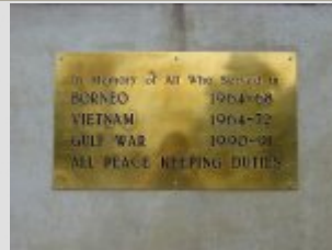
Conflict Plaque No. 2