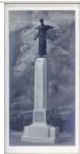
An Initial Design Proposal for the Memorial - Front View IM City Archives [PNCC11/8/3]