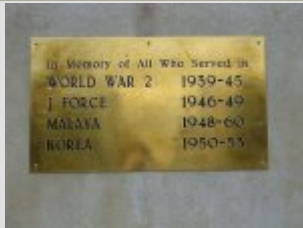
Conflict Plaque No. 1