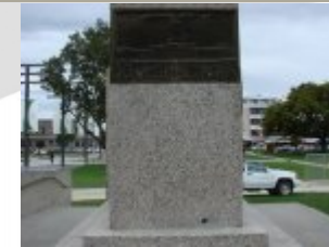
Right End Frieze