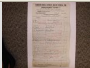
List of Contributors who signed up to donate money for the Memorial IM City Archives [PNCC11/8/2]