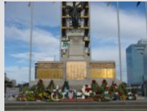
2007 ANZAC Wreaths on the steps of the War Memorial in The Square