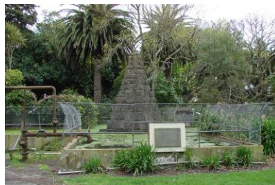
Memorial - 2007