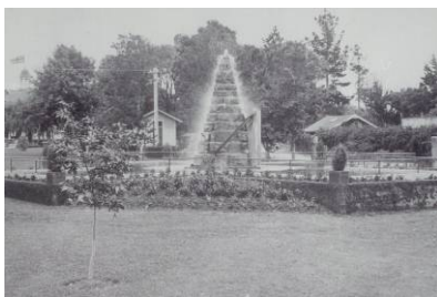
Memorial circa 1929